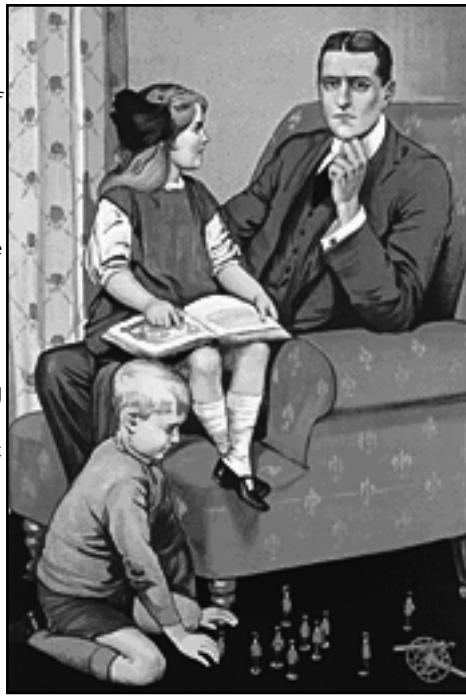
Daddy, what did you do to stop the BNP?

The last few years have seen the rise of the BNP in Britain. These fascist thugs now hold 17 Council seats and are making a big push to get a European MP. The BNP's policies are racist, homophobic, sexist and anti-working class. Their aim is to create a