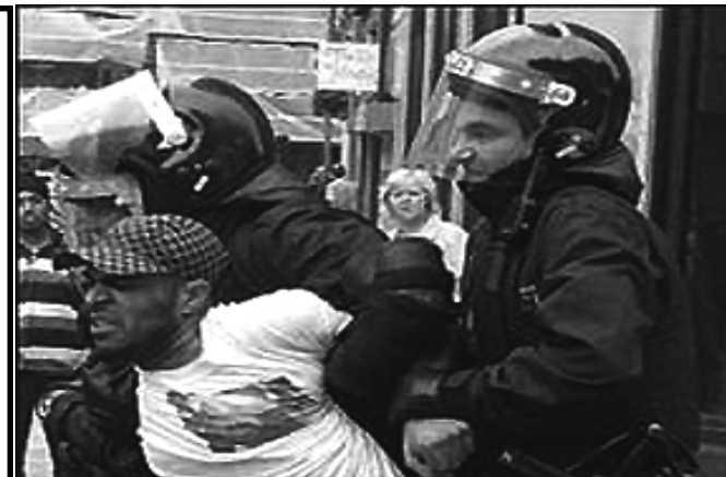
cops doing what they love - arresting a black man!

REVO campaigns against the SUS laws, deaths in police custody and the legal system that discriminates against Black and Asian people. We say disarm the police, repeal the racist laws, and organise community self-defence against the police and racist gangs.